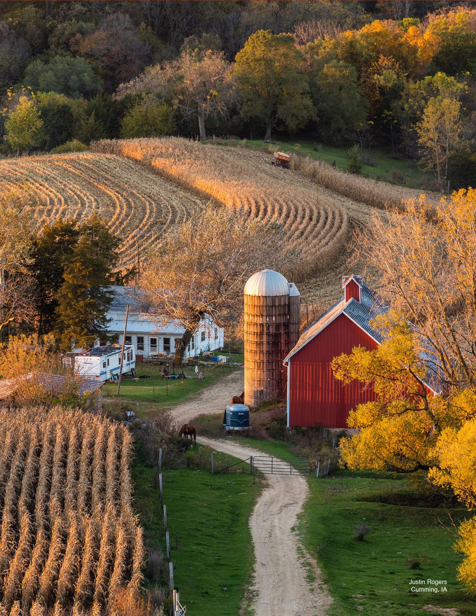
Justin Rogers Cumming, IA